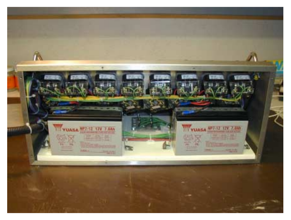
Inside view of console showing batteries