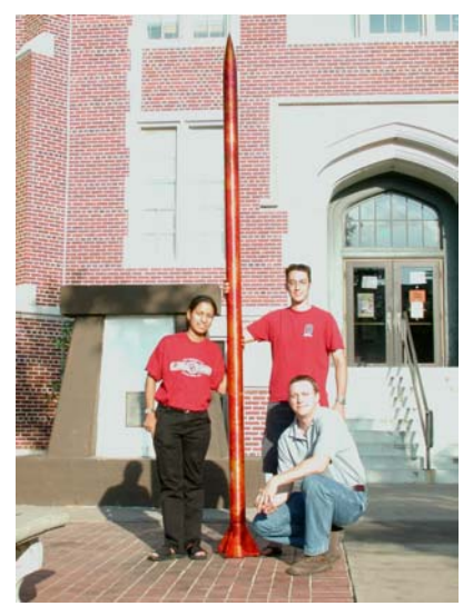
Figure 1. The Rocket

clear that we had to work with a metal rocket to be able to install reasonable sensors for data acquisition. We decided on using aluminum for minimum weight. Reaching supersonic speeds would only be possible if we used a large motor (N-size) in a minimum diameter casing.