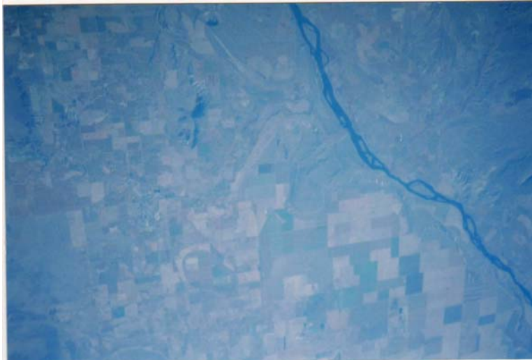
The Ground Photographed from Near Space