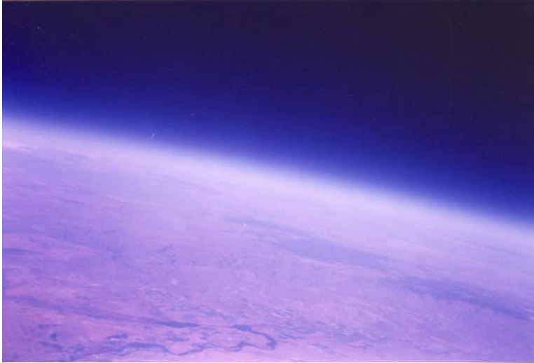
Photograph of Horizon in Near Space